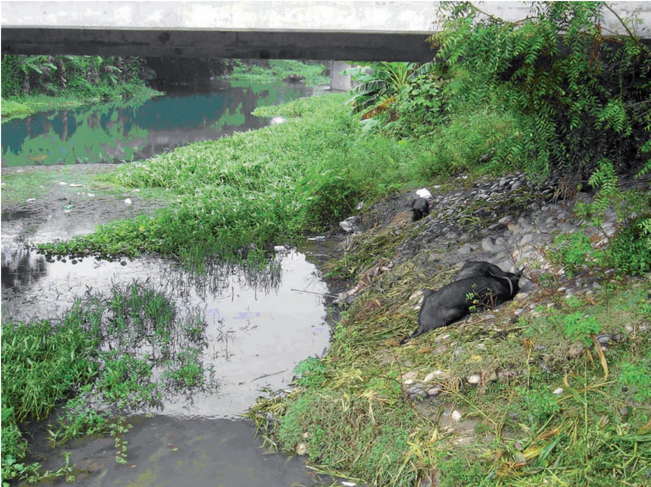
Photograph 1: Bridge over The Islet River at the eastern entry of Cayes (no. 4): water loaded with organic and sediment material clogged by aquatic plants and frequented by domestic animals.